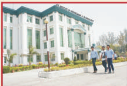
H R INSTITUTE OF ENGG. & TECHNOLOGY