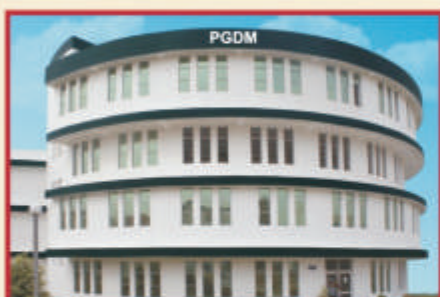
H R INSTITUTE OF PROFESSIONAL STUDIES