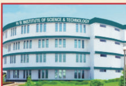
H R INSTITUTE OF SCIENCE & TECHNOLOGY