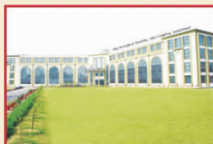
Delhi Public School, HRIT Campus